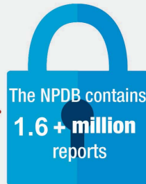
Figure as of Dec. 2020

Health care organizations, federal and state agencies, and others are required by law to submit reports.